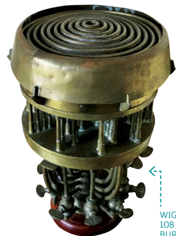
WIGHAM'S 108 JET GAS BURNER